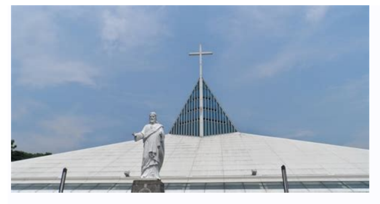
Ateneo de manila university uniform college. What is ateneo de manila university known for. Does ateneo de manila university shs uniform. School uniform of ateneo de manila university shs uniform. Ateneo de manila university shs uniform. School uniform of ateneo de manila university shs uniform.